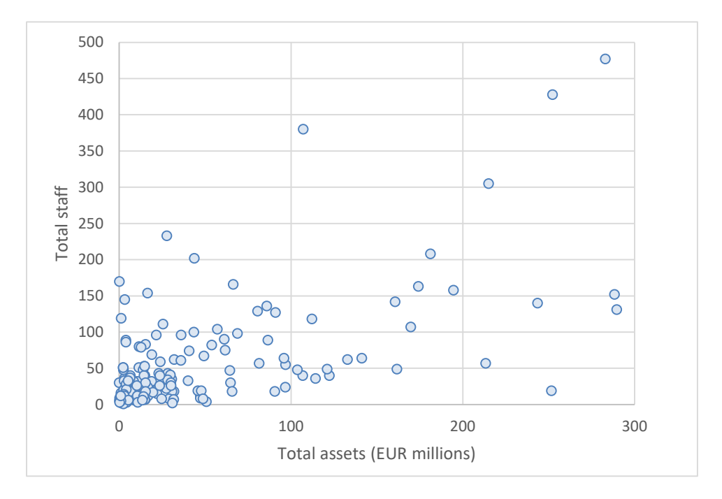
Figure 1 Total assets vs total staff (Total assets cut off at EUR 300 million)

Figure 3 below shows the relationship between total assets (in absolute terms and identified staff in the baseline scenario and scenario A (scenario B was not included as it is very similar to scenario A). In general, there is a very big overlap between the two scenarios, with only small differences visible in this chart.