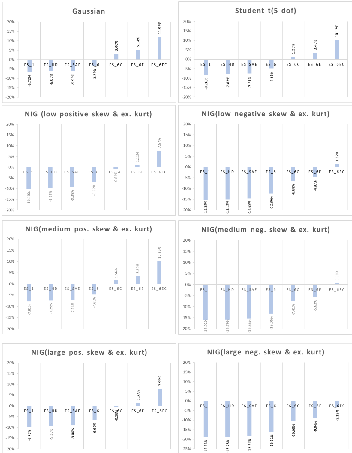
Figure 3: Expected shortfall estimation bias of 255 overlapping 10 days returns vs. the true ES (obtained as formulaic or large sample value) for different daily return increment distribution assumptions.