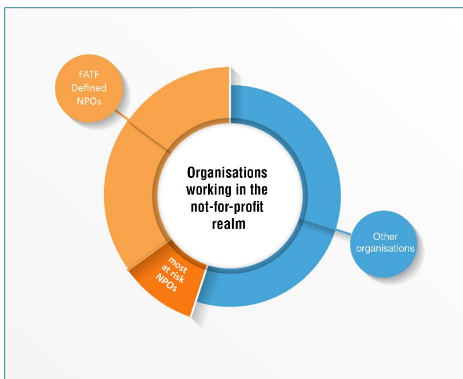
Figure Error! No text of specified style in document..2. Example of volume of most at-risk NPOs in a country's sector

Note: This figure provides an example of a jurisdiction's sector of organisations working in the not-for-profit realm. The volume of "most at-risk" NPO is small compared to the full subset of FATF defined NPOs.